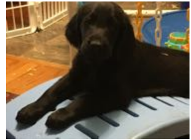
Kris Sobanski’s recent litter photos