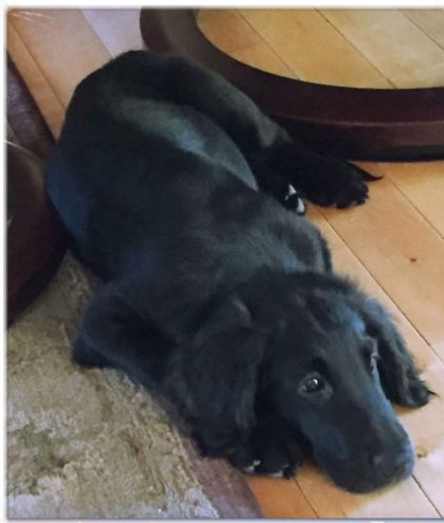
Patricia Temple's puppy Dillon