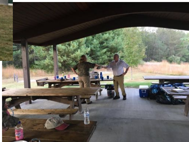
The fog and damp settled in at the end of the day. That was good timing since it insisted on showing up!

We're looking forward to an even better event next year. It will be held at West Thompson Dam again on October 6, 2018.