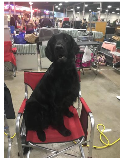
King on his throne!